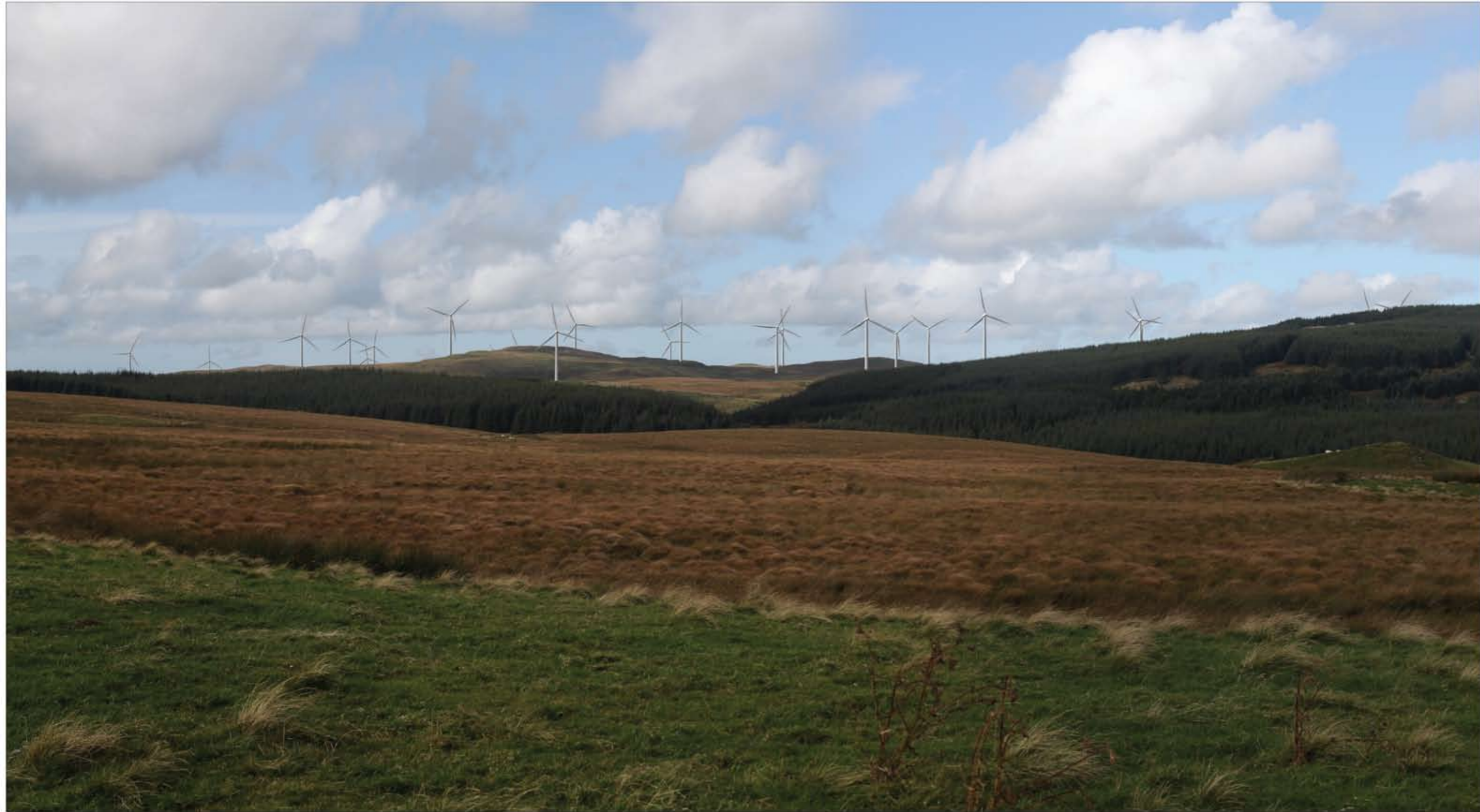
Photomontage enlarged by 200%